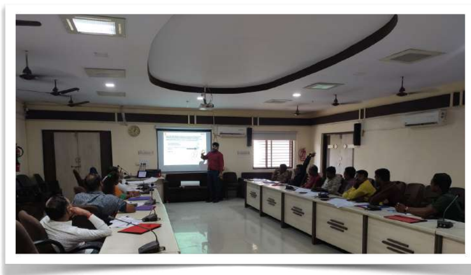
Workshop on Implementing MCR 2030 at Mansa Nagarpalika dated on 12th-13th September, 2023

Using the Preliminary Scorecard, it is easy to assess the risks in the city. These risks can be addressed through various measures like structural, non-structural, policy, legal, capacity building activities etc. It is required that these scorecard assessment are well converted into DRR actions and ultimately into plans. As Mansa Nagarpalika officials completed their scorecards, this upcoming workshop will help them to streamline their projects effectively.